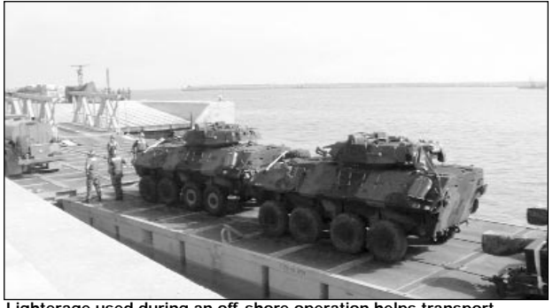
Lighterage used during an off-shore operation helps transport equipment from the MSC prepositioning ship Eugene A Obregon during NATO Exercise Dynamic Mix 2002.

The ships were recently involved in Operation "Dynamic Mix 2002" (May-June) and were part of a squadron which off-loaded more than 450 pieces of military hardware — delivering equipment for US Marines participating in NATO exercises off the coast of Spain. Obregon and Martin both belong to a squadron of six ships strategically pre-posi-