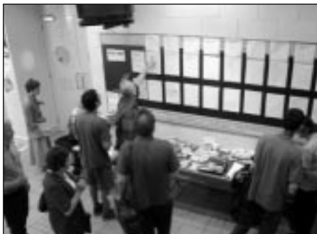
Triennial participants deciding which of the fantastic workshops to attend.