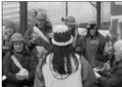
TP activists sing outside Faslane gates during February blockade.