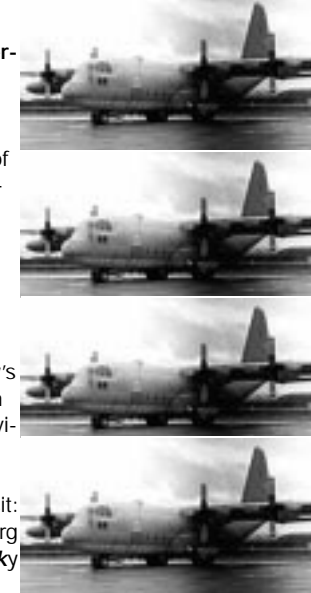
Daily Conference Upstart page 5