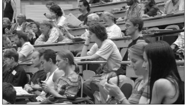
Participants at the plenary.

"All this is very significant in terms of reconciliation and