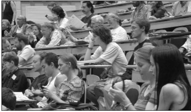
Participants at the plenary.

"All this is very significant in terms of reconciliation and